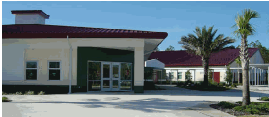
Timberlin Creek Elementary School 555 Pine Tree Lane St. Augustine, FL 32092

Pets brought to the Pet Friendly Shelter are required to have the following: