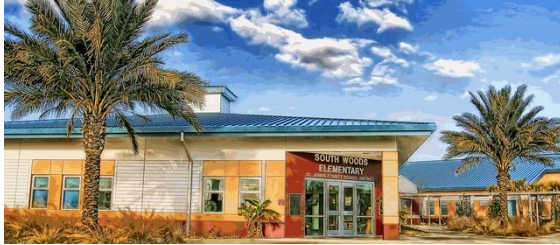
Southwoods Elementary School 4750 State Road 206 West Elkton, FL 32033

St. Johns County has established two Pet Friendly Shelters for emergency situations that require citizens to evacuate their homes. The following shelters will be the ONLY shelters that will accept you and your pet during an evacuation. Please listen to television and radio when an evacuation is ordered to determine which shelters are open because all shelters may not be open.